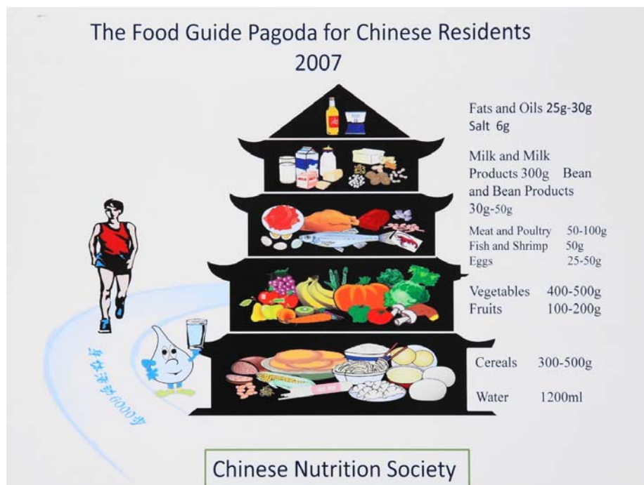
Figure 2. Chinese food Guide Pagoda 2007

There is no difference in food grouping or location between the FGP-1997 and FGP-2007, there are indeed differences in the recommended daily amount of some food groups. FGP-2007 proposed increased amount of milk and milk-products, aquatic products and fruits; decreased amount of meat and poultry and staple foods. In addition, a daily amount of drinking water of 1200 ml appeared for the first time with the Pagoda. A table is attached to the